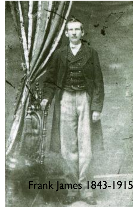
Frank James 1843-1915

courtesy of the Clay County Museum and Historical Society