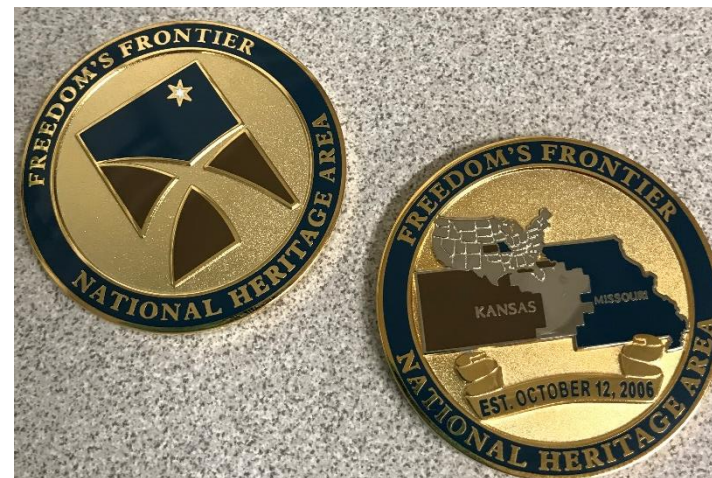
Freedom's Frontier Challenge Coin.