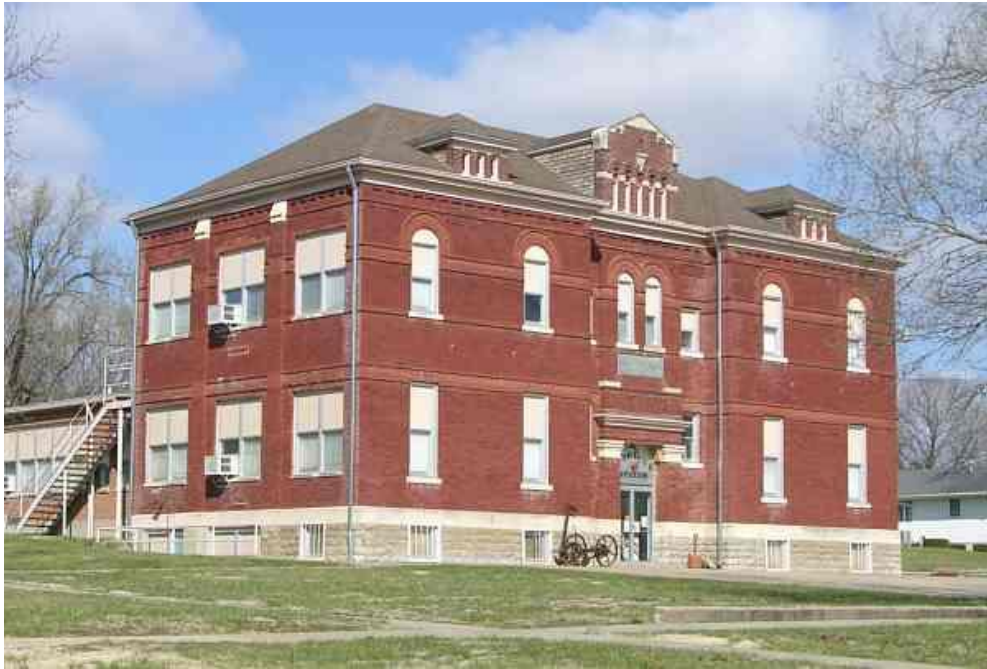
Schuyler Museum 117 S Dacotah Burlingame, KS 66413 (785) 654-3170 burlingamemuseum.com/

For our Thursday, March 8, 2018 Partnership meeting, we gathered at the Schuyler (pronounced Skyler) Museum in Burlingame, Kansas.