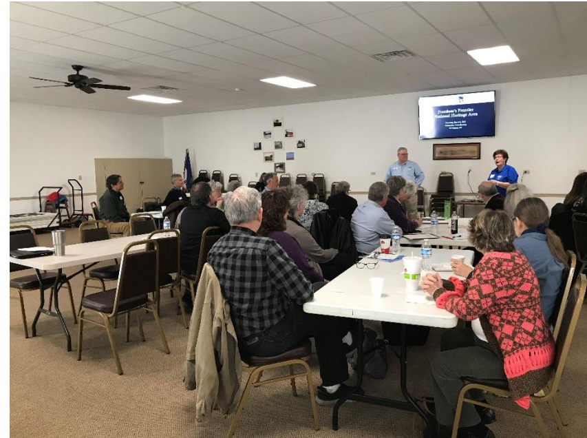
Meeting attendees learning about the Schuyler Museum prior to the beginning of the workshop.

Following a board of trustees meeting to review and synthesize our work on audience identification, we will be sending out a survey to all partners to help us set priorities, narrow down our target tourism audiences and identify which tools to work on developing to promote Freedom's Frontier and all of the great heritage sites where folks can visit and learn more about our shared stories.