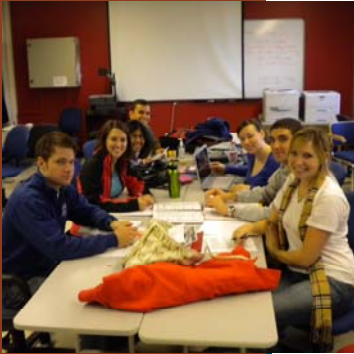
KU Student Group work on their FFNHA public relations & marketing campaign.