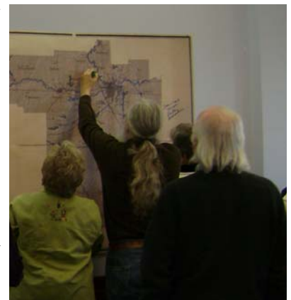
Partners learn story connections from one another at a meeting in Warrensburg, MO.