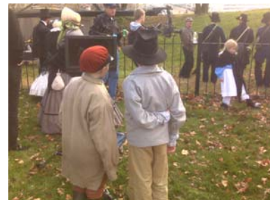
Child reenactors taking part in a reenactment in the heritage area.