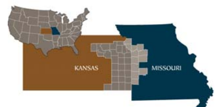
The 41 counties of Freedom's Frontier.